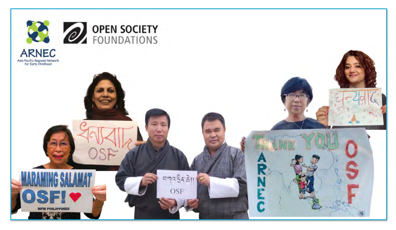
ARNEC provides a tribute to the OSF in honour of its 26-year Early Childhood Program and support to regional ECD networks

"This is not goodbye, but a beginning for ARNEC to continue your legacy promoting the development of young children in the region."